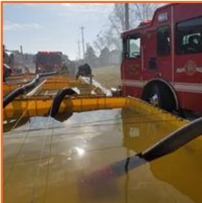
Above: The tender operation portable water tanks. Below: An excavator finding hot spots.