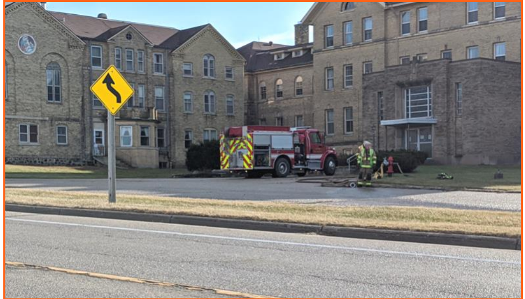
Above: Personnel await the next empty tender to arrive to refill with water at a US-18 fill-site.