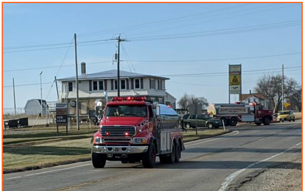
Below: At US-18 & CR-D, one tender (right background) begins backing down the road to the fire while another tender (foreground) returns to the fill site. (Photos by Gary Schmidt).