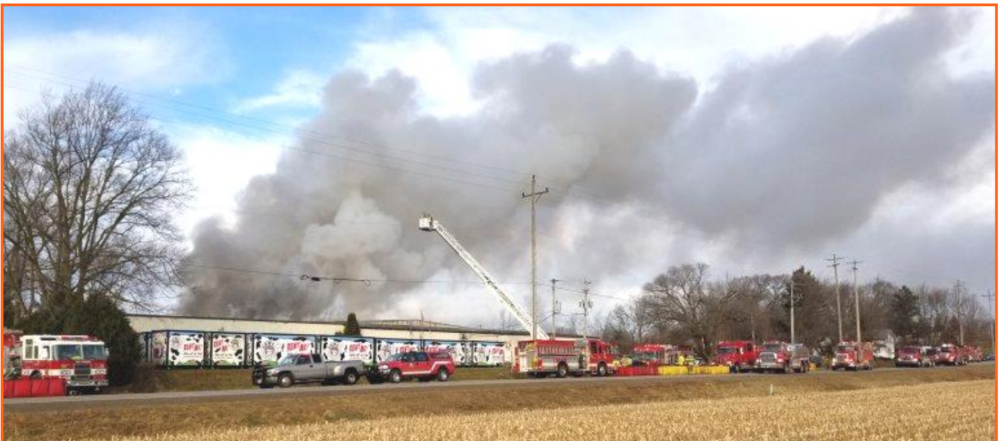
Front Side A facing East