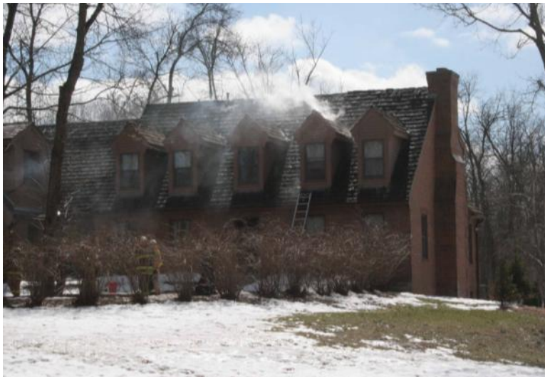
Below: March 23, 2014 - Div 106 Box 32-22 went to a 2nd alarm for a fire in a 3,200 sq ft house at 34971 Pabst Rd in the Village of Summit.