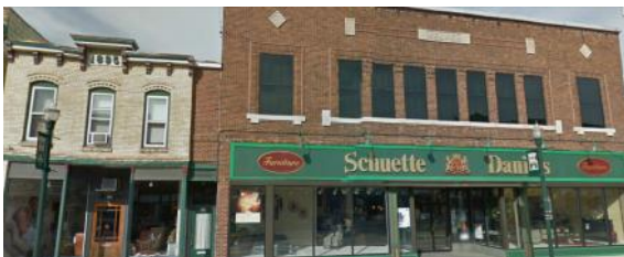
“Before Picture”

As the fire raged on, an explosion was heard, thought to be the natural gas lines in the building rupturing.