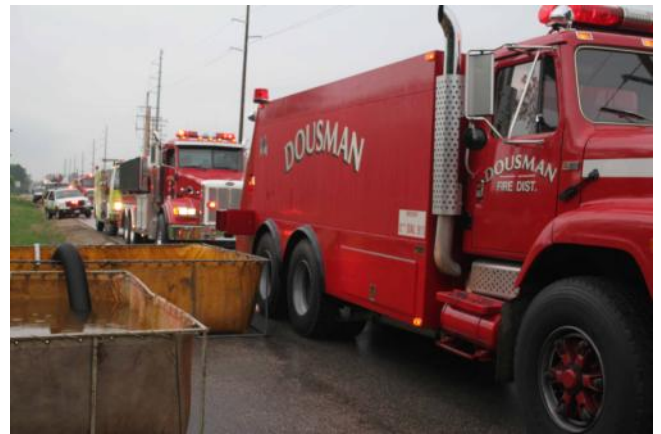
Above & Right: May 27, 2014 - The Dousman Fire District requested Waukesha County Div 106 Box 32-22 to a 2nd alarm level to prevent an adjoining structure from spreading to the house at 35000 Bartlett Road.