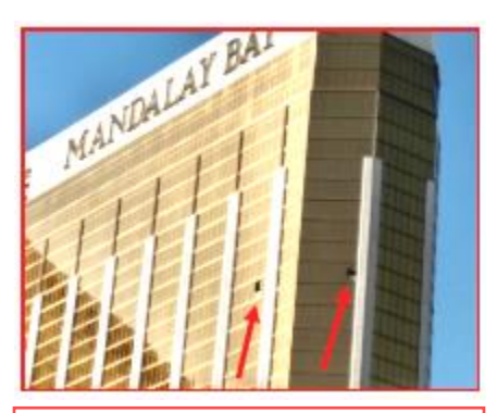
To hear the first hour of public safety radio transmissions of the Las Vegas mass shooting, go to: https://www.broadcastify.com/news/21

Top Left: the open-air venue as shown from a lower floor. Top Middle: the airport fuel tank farm targeted (shown from a lower floor). Top Right: the hallways longer than a football field, taken from elevator lobby. Some shots were fired from the far end of the hallway on a similar floor. Left: The two windows broke out by the shooter (left window faces airport).