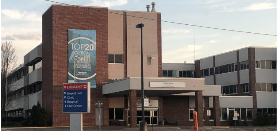
The Gundersen Tri-County Hospital