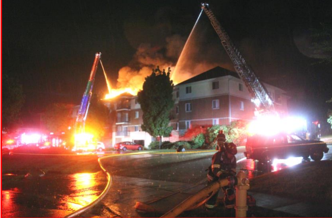
It was raining so hard, note the raindrops bouncing off the driveway in the lower picture.