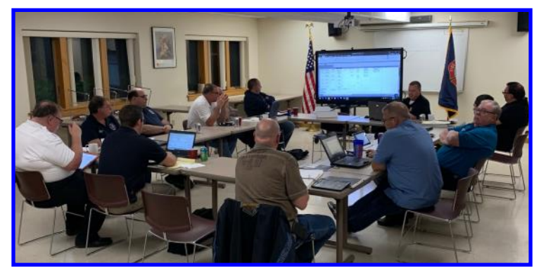
Wisconsin Divisions 101, 102, 103 and Illinois Division 4 annual Box Cards Review.

MABAS Wisconsin Divisions 101 (Kenosha), 102 (Racine), 103 (Walworth) and MABAS Illinois Division 4 (Lake) meet once a year to discuss topics in the area.