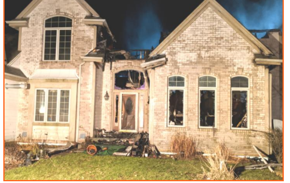
The house had some brick veneer, but otherwise was of lightweight wood frame that provided for quick fire-spread and destruction.

The Grafton Fire Department was notified at 4:49pm. At 4:50pm, a full still was requested, bringing in mutual aid from our two nearest neighboring departments, due to the