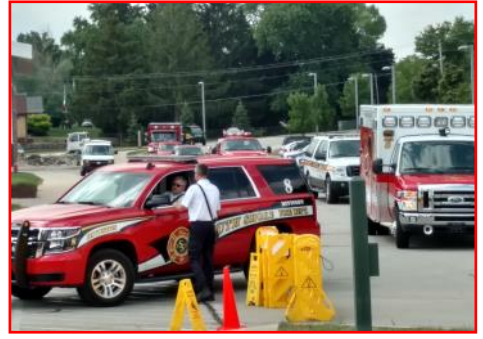
The Division 102 "Ambulance" Strike Team arrives.

From the local dispatchers, to Rock County (Badger Red), MABAS Wisconsin, and the Milwaukee Fire Bell, we were able to have participation from all avenues in the large system. I look forward to taking this to the next step and deploying resources into a hands-on event.