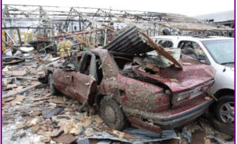
The Falk Corporation explosion.

Forty-three workers were injured and three were killed. There were over 500 people on site in the area at the time.