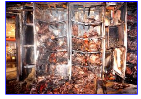
These units are used as backup power for computer server farms, valued at over $1,000,000 each. One was damaged by fire and another suffered heavy smoke damage.