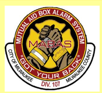
MABAS Division 107 Operations – August Drill Summary