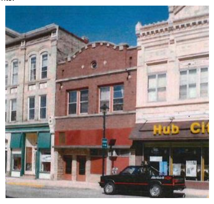
Downtown Plymouth - Before the Fire