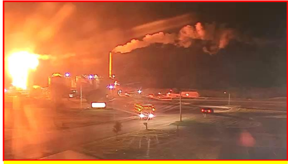
Explosion captured by the firehouse severe weather cam.

Badger State Ethanol (BSE) is a dry-mill ethanol production facility. BSE has the production capacity of over 85 million gallons of ethanol per year. In addition to distilled dried grains with solubles (DDGS), also produced is 50% corn protein (Dry Matter Basis) feed and corn oil. Carbon dioxide is also captured for use in the food industry.