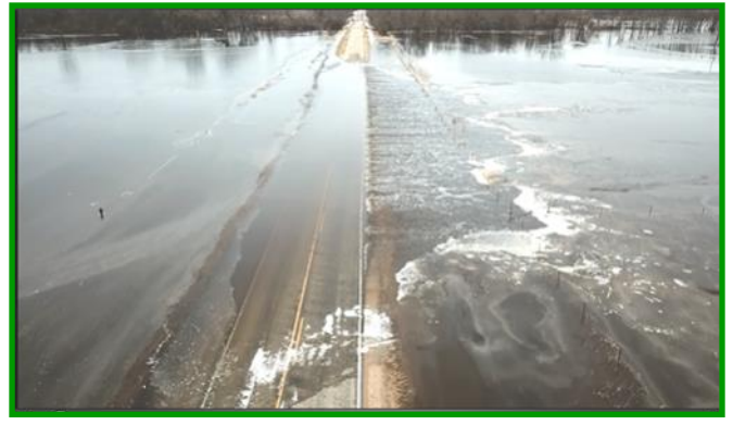
Above: County T near Brodhead.

Several towns and the Green County Highway Department were eligible to apply to the WI Disaster Fund. Damages to roads will exceed to over well over $250,000.00.