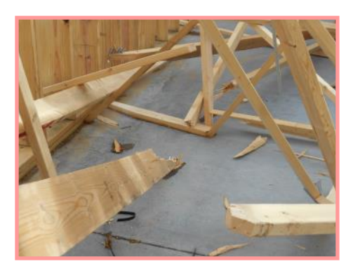
A close-up of trusses that split at the scene of the building collapse.

This allowed the investigator to quickly see what had happened and get information quickly.