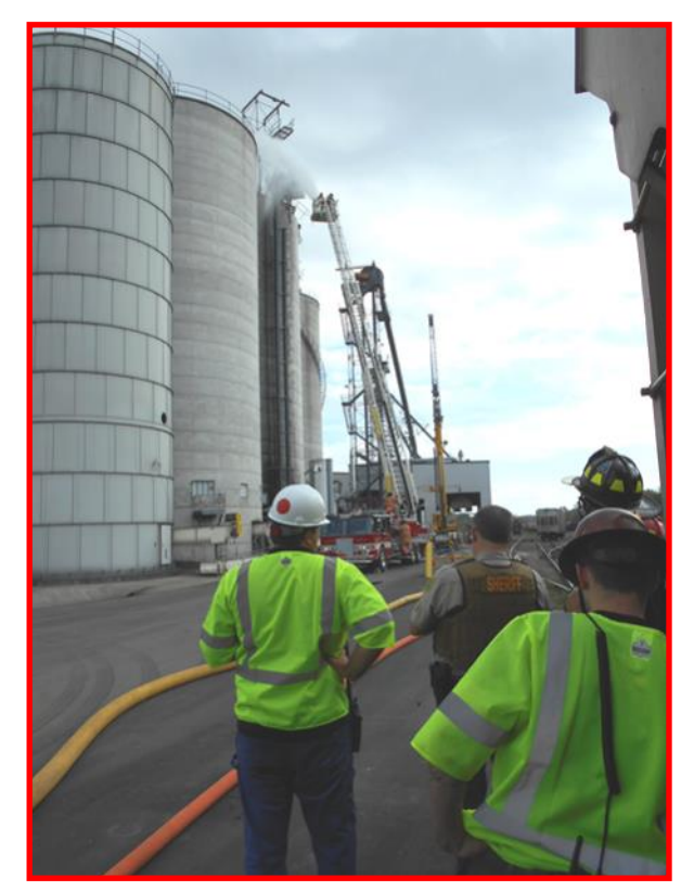
Observation of the incident as fire crews are indirectly placing water on the remaining silo contents with a spray pattern. A crane was also in place at this time to pull off the loose pieces after the explosion.